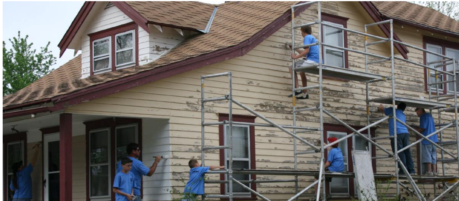
Just one of Hope's 10 Love Wichita projects.